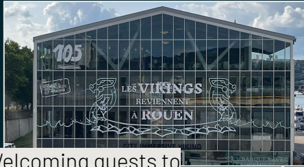
Welcoming guests to the Cité Immersive Viking